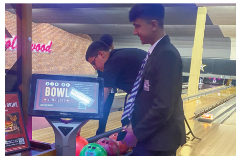
Y7 and Y8 'Togetherness' activities at Hollywood Bowl.