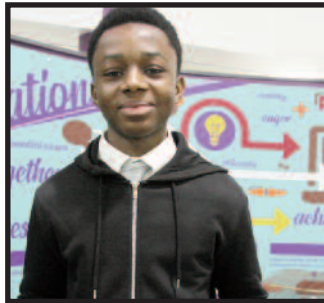
Congratulations to these students who were entered into a draw and won SUFC tickets for making progress in sport studies and attending school every day.

Attending school every day, zero consequences, good progress in their studies and 10 or more 'Recognition Points' (R1s), gives students the opportunity to be entered into competitions and raffle draws for amazing prizes.