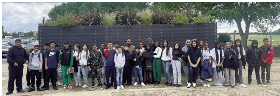
Y8s had a great day at Flamingo Land! Our students were excellent role models on this exciting trip.