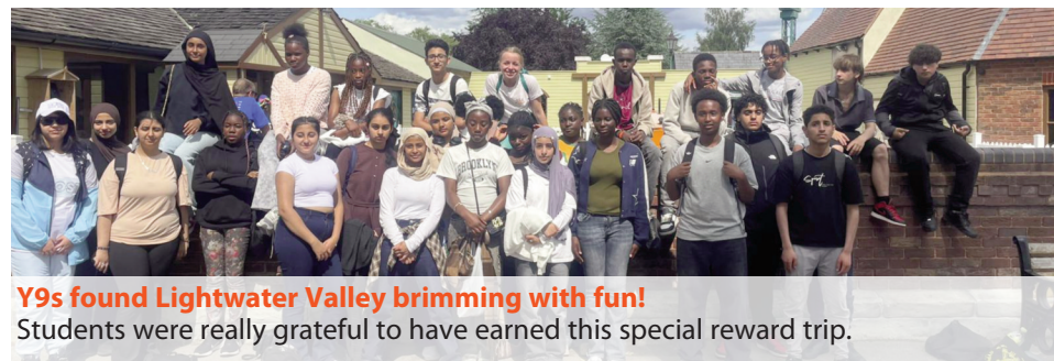
Y9s found Lightwater Valley brimming with fun! Students were really grateful to have earned this special reward trip.