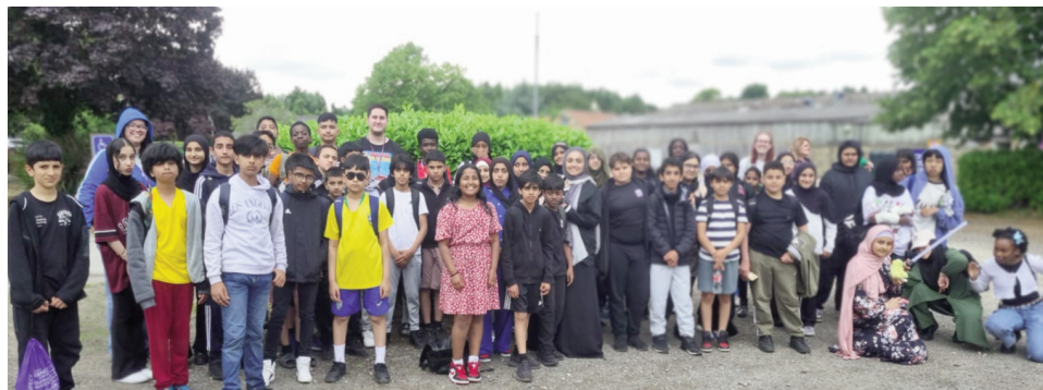
Y7s joined in the fun at Drayton Manor! A well deserved trip where our students loved every minute.