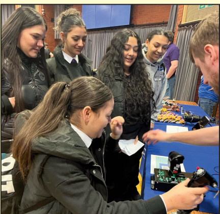
Y10 students attending the Exploring STEM event at Sheffield University.