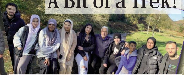
A very enjoyable trip to Derwent Dam. Students walked around the Dam and took in the breathtaking views whilst participating in team building and togetherness activities.