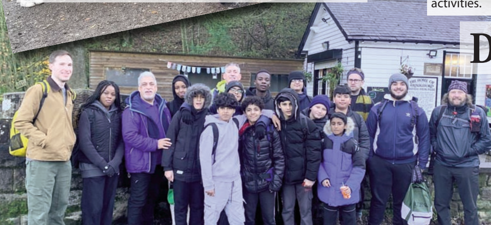
Duke of Edinburgh (DofE) introductory walk where parents and family members were invited to join us on a beautiful autumn sunny day to experience a day out in the Peak District, walking from Grindleford station to Endcliffe Park and giving the students a taste of what is involved in the DofE Bronze Award along the way.