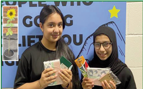
Y7 girls, winners of our Sunflower Competition.