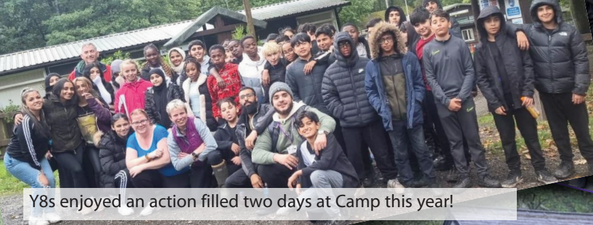
Y8s enjoyed an action filled two days at Camp this year!