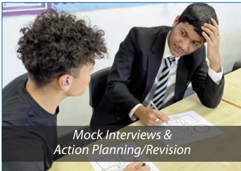
Mock Interviews & Action Planning/Revision