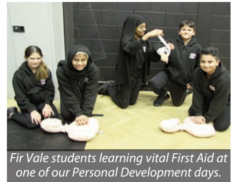
Fir Vale students learning vital First Aid at one of our Personal Development days.

“ Leaders have developed a high-quality personal development offer. ”