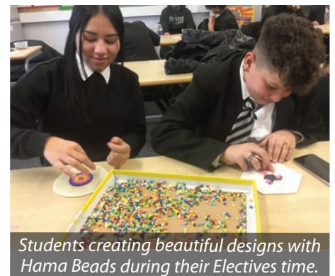
Students creating beautiful designs with Hama Beads during their Electives time.