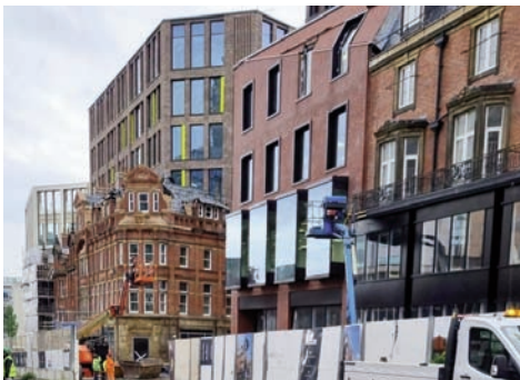
Photograph was taken by one of our students.

Y11 Geography students visited Sheffield City Centre to complete their second fieldwork on regeneration in the city and the effects that this has.