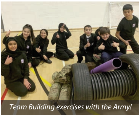
Team Building exercises with the Army!

“ Pupils enjoy their ‘elective’ activities each Wednesday. ”